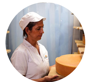
Identifying impacts generated by our operations