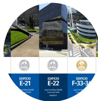
Operational efficiency and regulatory compliance