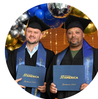
Talent and commitment to our employees